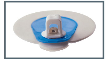
F = 3 mm fitting