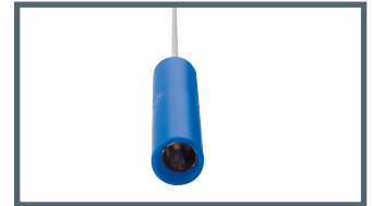
A = 4 mm connector