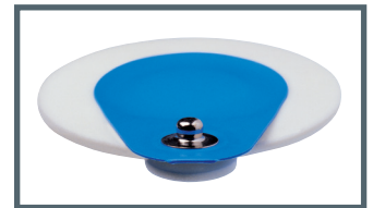
S = Stud