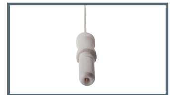
K = 1.5 mm connector