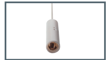
F = 3 mm connector