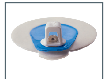
F = 3 mm fitting