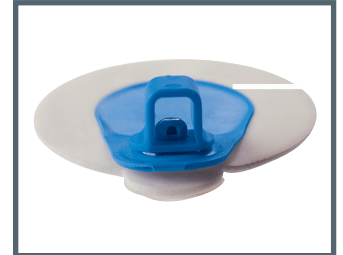
A = 4 mm fitting