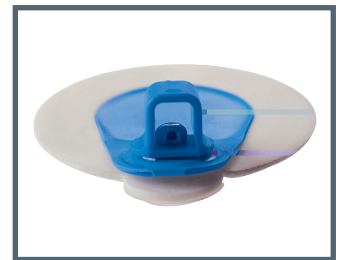
A = 4 mm fitting